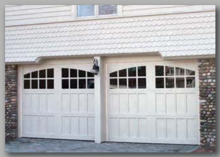
Model T308A, Arched Windows