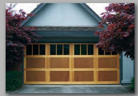
Model T003S, Double Car