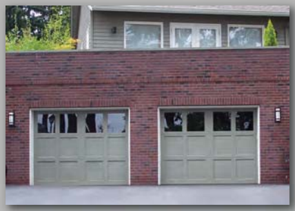
Model T102S, Custom Mullion Width