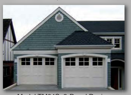
Model TM04S, 3-Panel Design