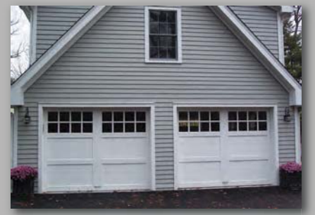
Model T008S, 7' High 3-Section