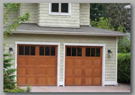
Model T103S, 8' High 4-Section

The Township Collection offers the warmth and beauty of the real wood carriage house doors that conveniently operate overhead; just like conventional garage doors.